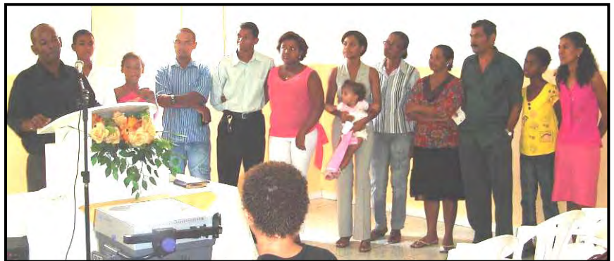
Birth of New Congregation! In Marcos Freire – Municipality of Socorro